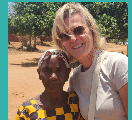
World Connect led a group of supporters on a trip to Malawi in October 2024 to visit five projects and meet and celebrate with our community partners and the Mudzi Connect team, a locally-led community investment partner.